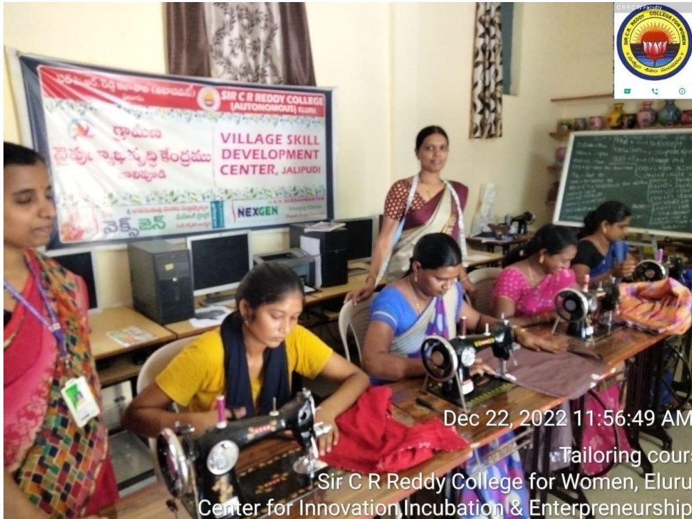
Cell Members conducting training program on Tailoring