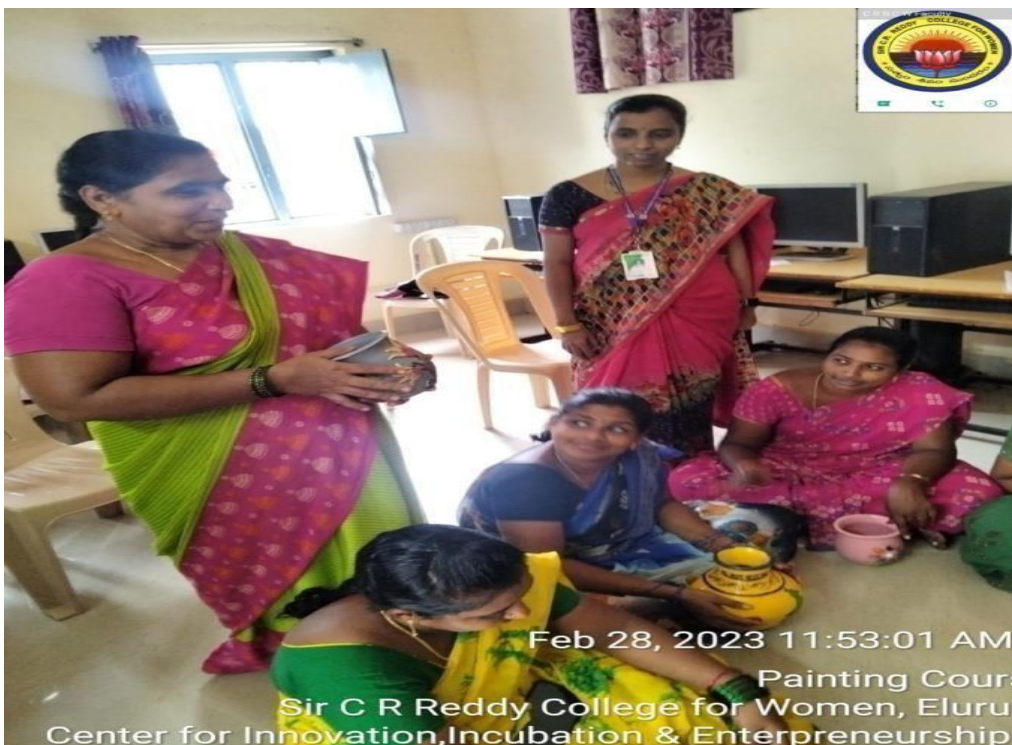
Villagers learning and practicing pot painting work