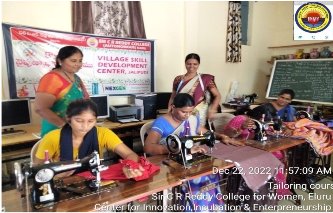
Jalipudi villagers participating in the program