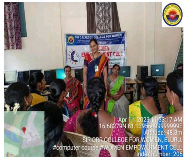
Women Empowerment Cell Members conducted computer course Training for jalipudi Villagers