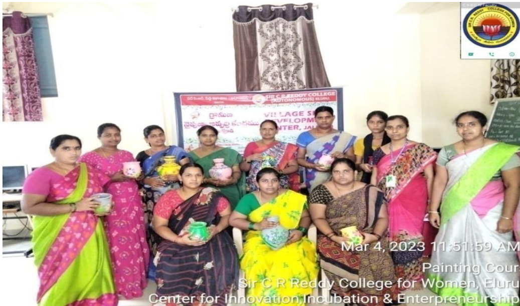
Jalipudi villagers with Cell Members