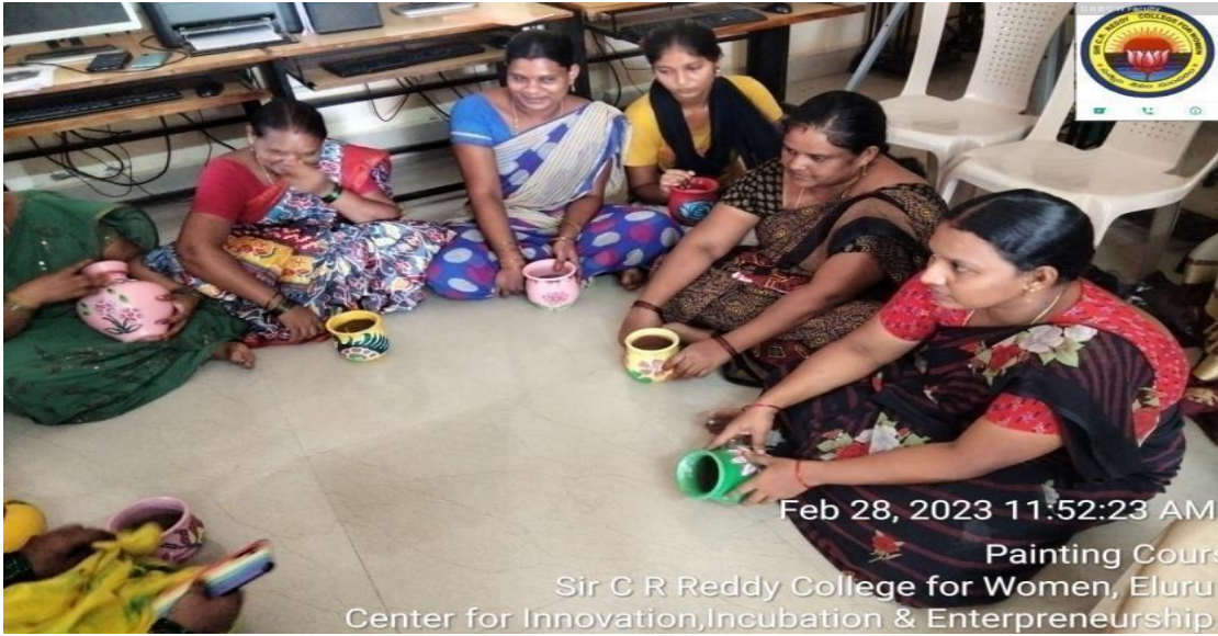
Jalipudi villagers presenting their work